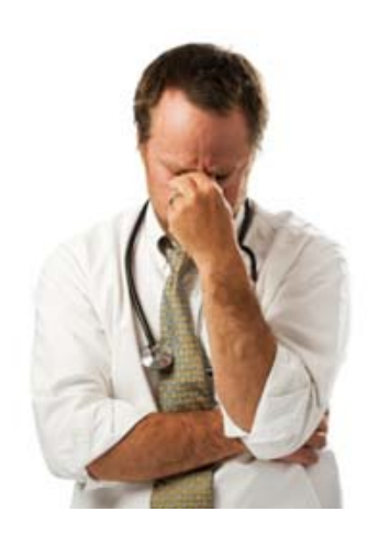
The Frustrated Doctor

The failure to recognize biol ogical individuality is the fatal flaw of most scientific studies referenced by traditional and even alternative medical journals. The statistically significan t group w hose condition bene fits from either a prescriptive or nat ural agent under study must have some quality which distinguishes it from the unresponsive group. This unrecognized quality is clearly revealed by Functional Medici ne testing to be a difference in body chemistry and other physiological aberrations .